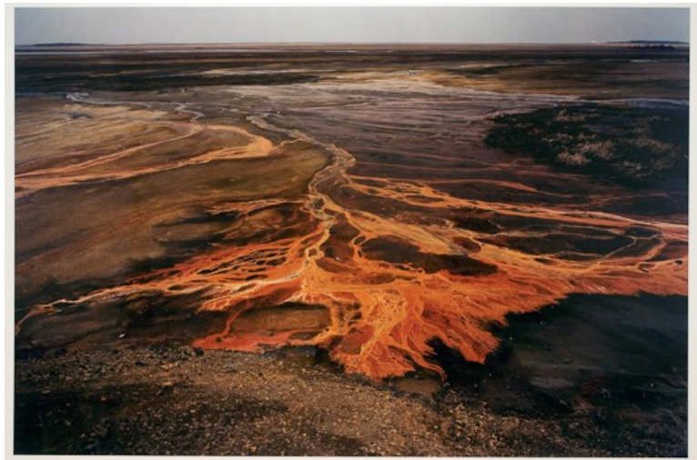
Edward Burtynsky, Nickel Tailings #30 , Sudbury, Ontario, 1996, Mount Holyoke College Art Museum