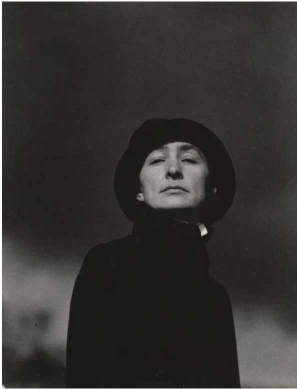
Alfred Steiglitz, Georgia O'Keefe , 1923, Museum of Modern Art, New York